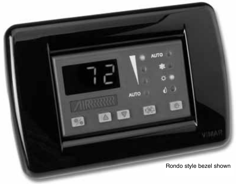
Rondo style bezel shown